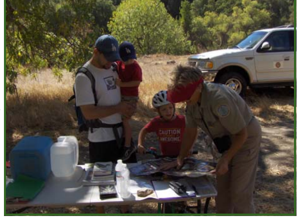
Family of visitors enjoying the information available.