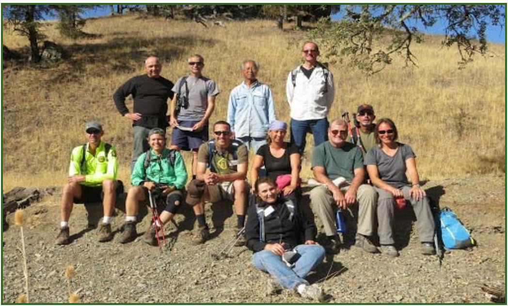
New volunteer class of 2014 at Los Cruceros on day 2 of the ridealong.

Eventful outings to Pacheco Falls, Coit Lake, and Mustang Peak followed the day's training. It's noteworthy that the performances during the ridealong were so realistic that the trainees were skeptical when a real incident occurred—a plane landing illegally at Paradise Flat, witnessed by 12 trainees and volunteers on Mustang Peak! See photograph on page 5.