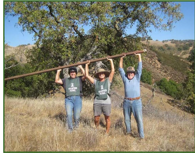
Raising the flag pole.

All in all, we were blessed with great weather, good company, great food, and the pleasure of meeting our newest MAU member.