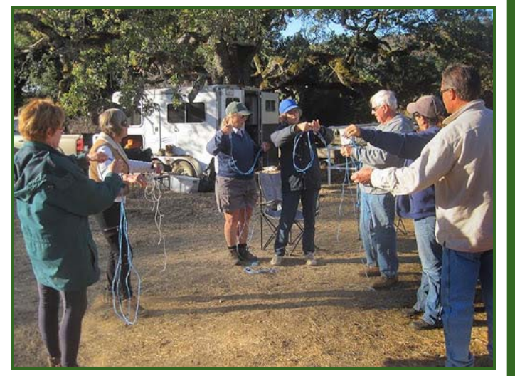
Making a twine halter.