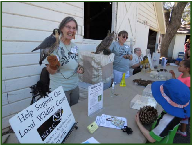
WERC's ambassador animals and birds.