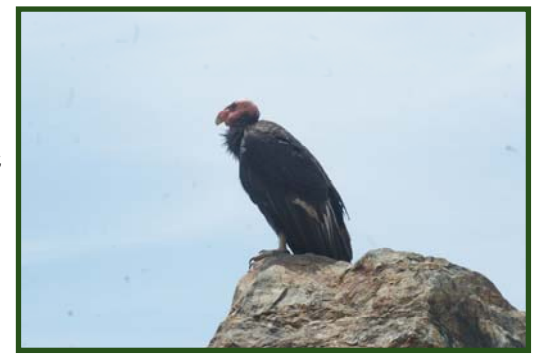
Condor on a rocky cliff.

All condors have numbered tags on one or both wings, allowing field crews to identify birds individually, and all have VHF radio transmitters attached to wing tags and/or tail feathers to allow us to radio-track them. Radio-tracking enables us to confirm that condors are alive, active, and moving. When a transmitter has not moved in 10 hours, it emits a signal at twice the normal speed, what we call "mort mode," and it indicates one of two things: a dead condor, or a transmitter attached to a tail feather which has fallen off. Dead birds are recovered as quickly as possible to allow the forensics lab the best chance to determine a cause of death. In addition, about a third of the flock wear GPS transmitters, which can tell us how high they fly, where they roost, how fast they fly, where they spend their time, and more. All the information presented in the opening paragraph was taken from GPS information.