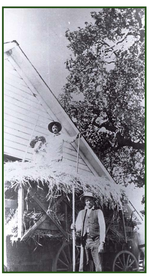
Loading hay into the barn.