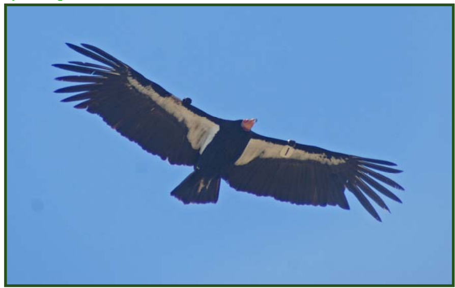
California Condor.