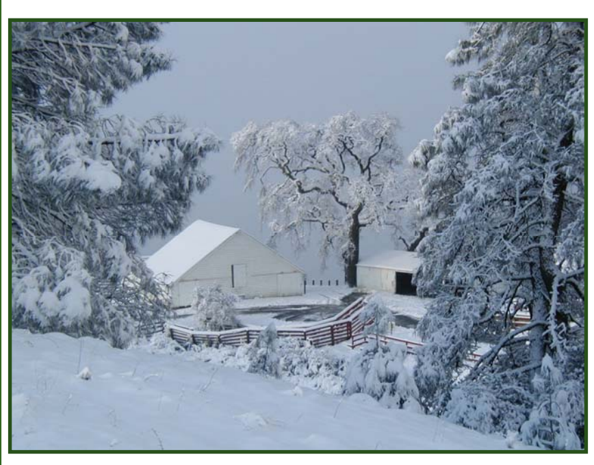
The white barn in the snow.

The old barn needs your help. A special account has been set up in the visitor center to accept donations to repair the white barn. I hope you will give generously to keep this special place available for park visitors for years to come. Donations may be mailed to the Pine Ridge Association, 9100 East Dunne Avenue, Morgan Hill, CA 95037, or they may be made in person in the visitor center.